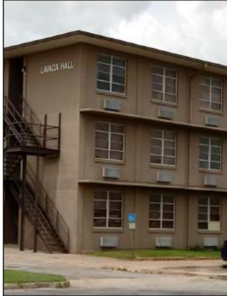
Lavaca Hall Dormitory